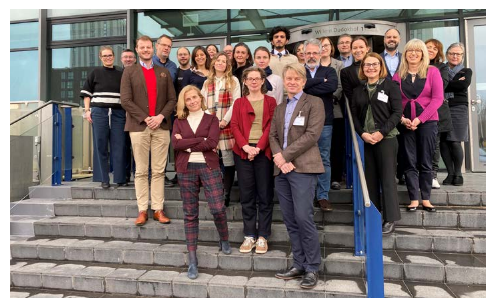
EUnetHTA Executive Board, January 2020 (Diemen, Netherlands)